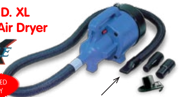
Unique "air sweep" nozzle is specially designed to blow water out of the coat in sheets!