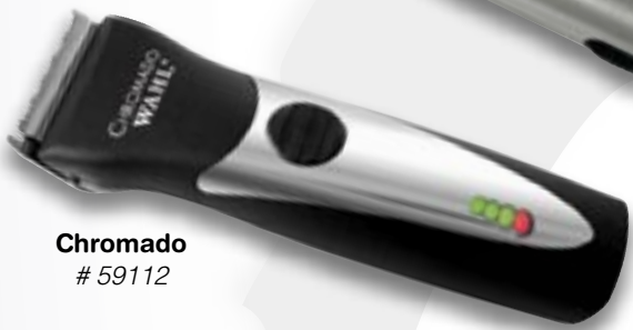
Chromado # 59112