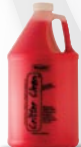
Crittter Clean Shampoo # 58769

Fits WAHL Bravura, Arco SE & Chromado Clippers.