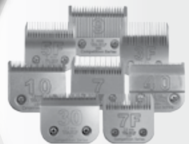
Competition Series Blades Model #s: 58201 - 58228 Fit WAHL KM2, WAHL Switchblade, Oster® & Andis® clippers.