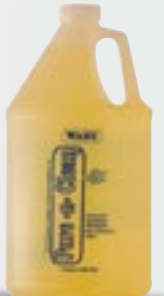
Pure-n-Clean Shampoo # 58764