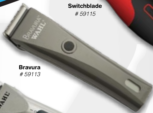
Bravura # 59113