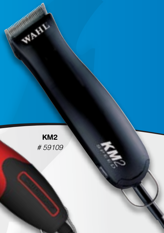
KM2 # 59109

"Using quality products is one key to being successful, using Wahl helps me be more efficient."