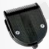
Champion Blade #58189