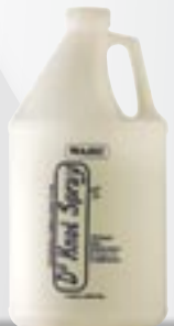
D'Knot Spray #58781