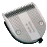
Coarse Blade #58191

Fits WAHL Bravura, Arco SE & Chromado Clippers.