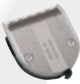
Standard Blade #58190