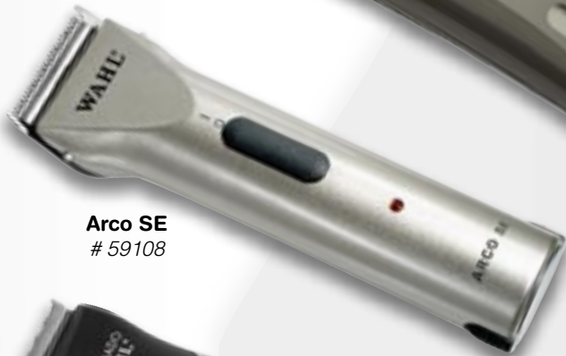
Arco SE # 59108